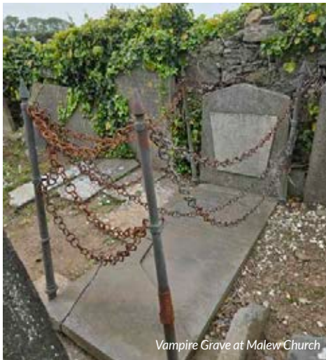
Vampire Grave at Malew Church